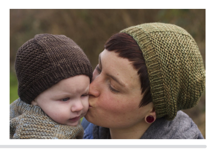
free patterns and tutorials